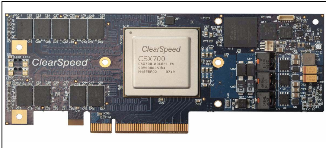
Figure 2. Advance CSX700 PCIe accelerator card

The Advance e710 Accelerator card (shown in Figure 2 ) is based on the CSX700 double-precision, floating-point accelerator. It is designed for use in workstation and server-style PC systems.